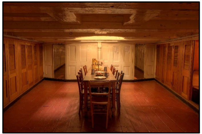
The Wardroom or Gunroom on HMS Unicorn