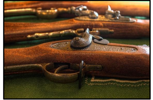
Muskets from the 19 th century

To find the answers you will have to explore the ship, read the panels and look at the different objects on display.