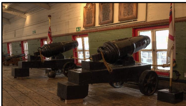
Two carronades on the Weather Deck on HMS Unicorn